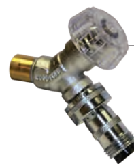
26C Combination 1/2" Copper Tube 3/4" Copper Tube