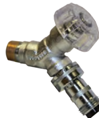
26CP Combination 1/2" Copper Tube 1/2" MPT