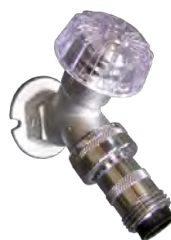
26P-1/2 1/2" FPT 26P-3/4 3/4" FPT